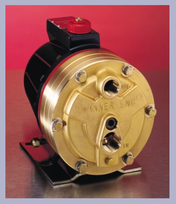
Kel-Cell® DPC is available on all D-10 and G-10 pumps including slurry duty models and D-12 and G-12 models